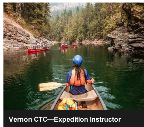
Vernon CTC—Expedition Instructor